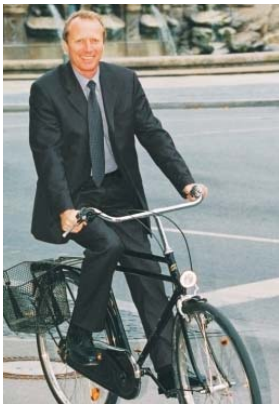
Mayor of the City of Munich Hep Monatzeder